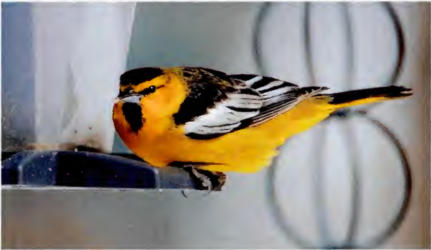
Figure F. Western Tanager, Baldwin, Nassau County, 11 Feb 07, Figure G. Bullock's Oriole, Phoenicia, Ulster County, 9 March 2007.